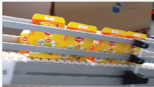
Friction Chain for 30° Incline