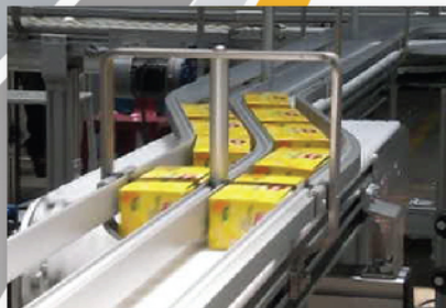
Plain Chain Conveyor