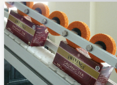
Plain Chain Conveyor with Box Incline Unit