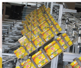
Chute with Pneumatic Controls