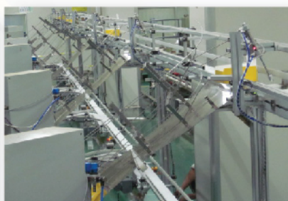
Chute for Filling Machine