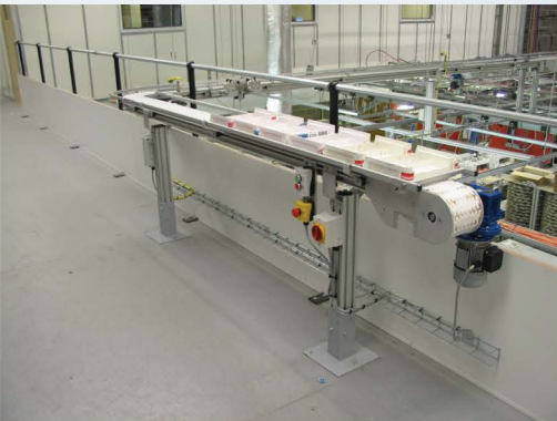
Feed onto Mezzanine Floor