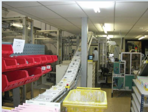
Friction Chain Decline up to 25°