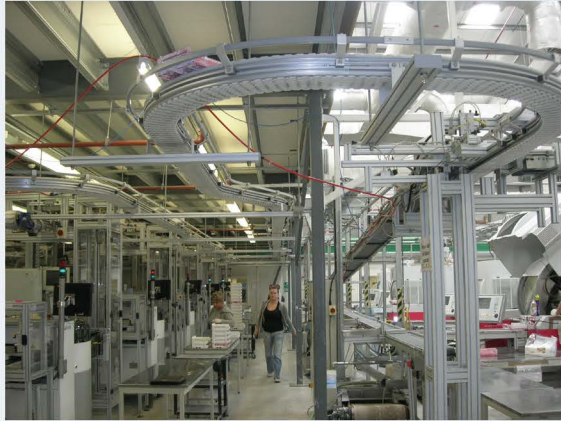
Complete Distribution System

By supporting conveyor from the ceiling, trays can be routed long distances without creating aisle access restrictions. Utilizing vertical space conserves valuable factory floor space.