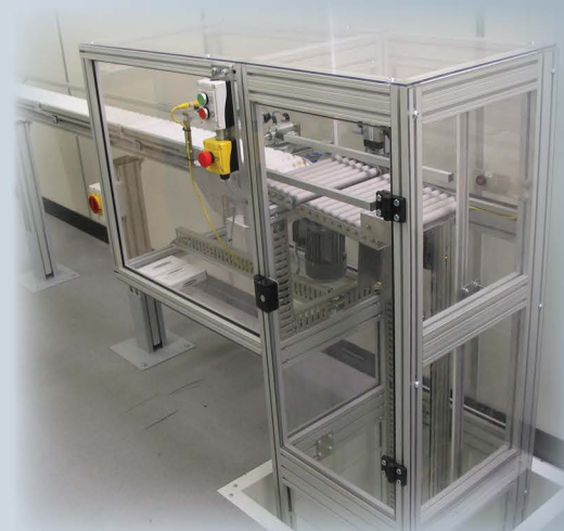
Mezzanine Floor Lifter