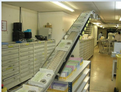
Friction Chain Incline