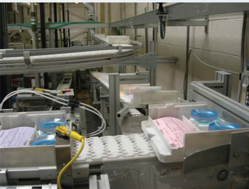
Side Push Unit